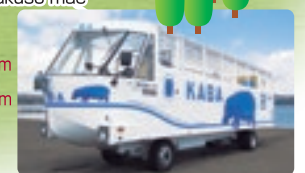
Amphibian (Land and Water) Bus "YAMANAKAKO NO KABA" Runs from "Asahigaoka" Dedicated line for reservation: 0555-73-8181

Altitude 982m Lake Area 6.67km 2 Water Depth 15m Circumference 13.5km