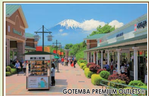
Gotemba Premium Outlets